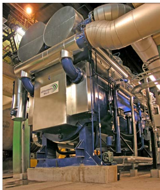
Absorption heat pump.