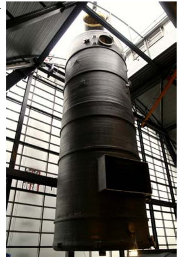
Scrubber during installation.

The condensate water produced is fed back upstream to the flue gas cleaning scrubbers. In normal operation, this water replaces all the fresh water used in the gas treatment.